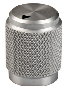
OED-50 - Clear