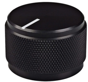
OED-90 - Black