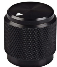
OED-63 - Black