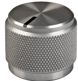
OED-75 - Clear