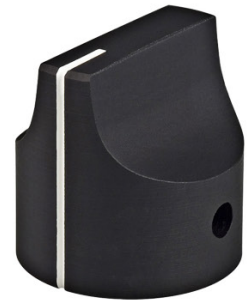
HD-90 - Black

Partial top and full-length side saw cut indicator line. Two 6-32 set screws.