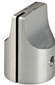
HD-75 - Clear