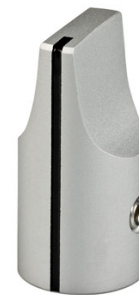
HD-50 - Clear