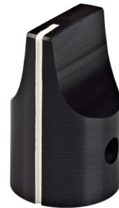
HD-63 - Black